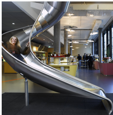
Google Zurich location

Imagine an engineer being paged at 4am, because there are only a few petabytes of storage space left.